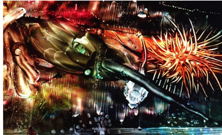
Title: Abyssals 5 Technique: pictoluminico oil Dimensions: 85 x 100 cms Year: 2017