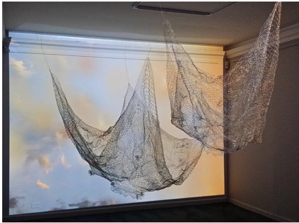
Title: Atarraya Technique: Woven Steel Thread Variable dimensions Year: 2017