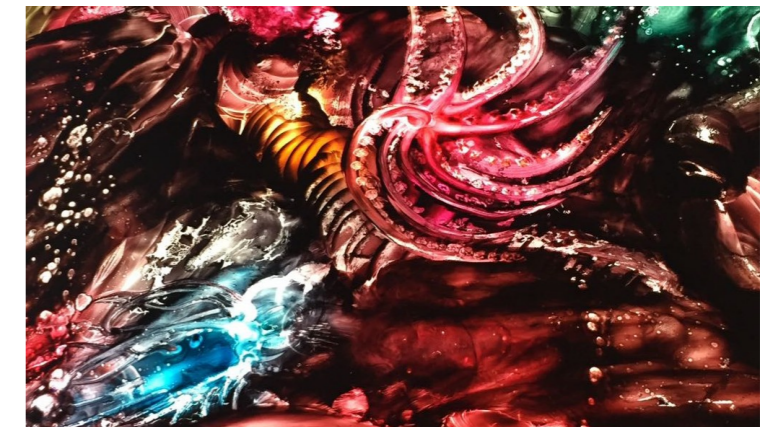
Title: Abyssals 8 Technique: pictoluminico oil Dimensions: 85 x 94 cms Year: 2017