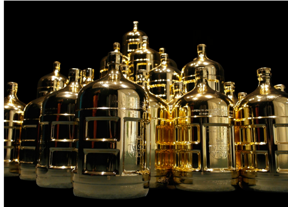
Title: Espeletia Technique: Installation Variable dimensions Year: 2017