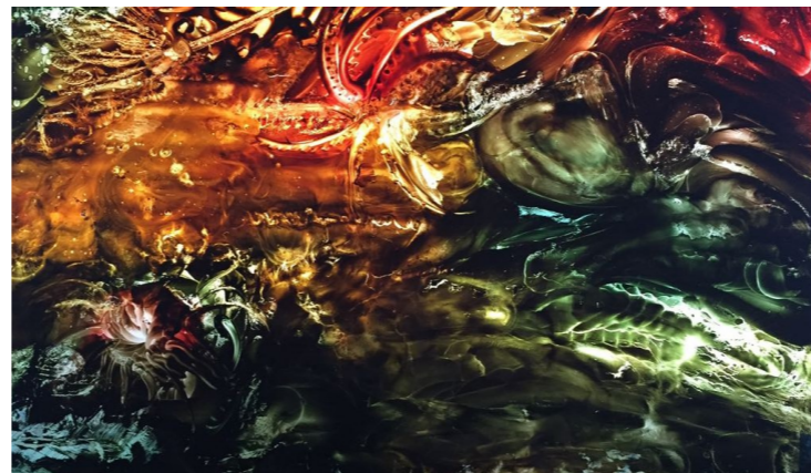
Title: Abyssals 7 Technique: pictoluminico oil Dimensions: 89 x 95 cms Year: 2017